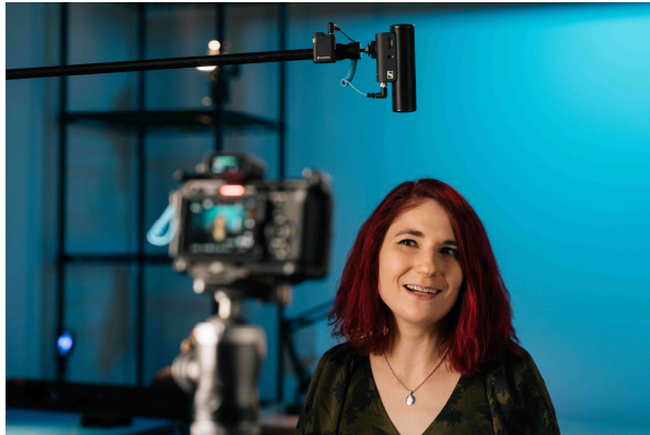
Profile Wireless can also be used to create a wireless boom, here in combination with an MKE 400 mini-shotgun mic

The Profile Wireless 1-channel mic system comes in a rugged pouch that includes the clip-on microphone with mini windshield and magnetic mount, a two-channel receiver, two USB cables, USB-C and Lightning adapters, a camera cable and a shoe mount adapter. As all Profile Wireless components can also be bought separately, nothing stands in the way of expanding the system to two channels at a later point in time.