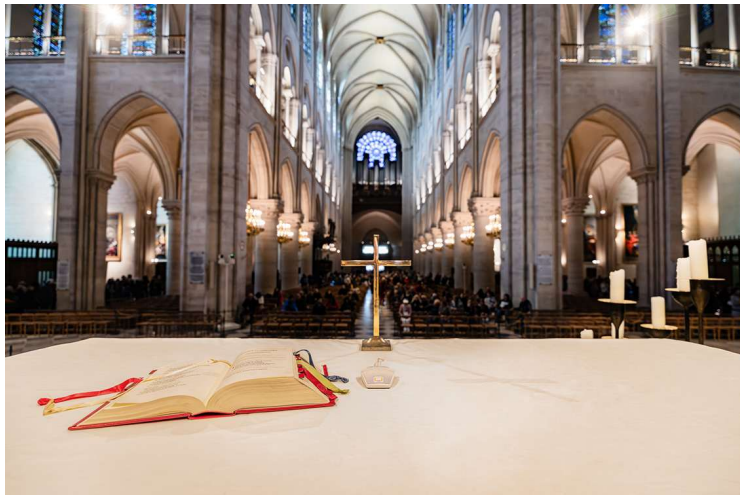
Highly valued at Notre-Dame for the video recordings of masses: the MEB 114 boundary microphone on the altar is both unobtrusive and aesthetic, with a very consistent pick-up pattern across its spectrum

The cathedral also has an audiovisual control room, from which the teams of television channel KTO provide daily broadcasts. “When unobtrusive sound capture is required, the microphone chosen for the altar of Notre-Dame, the MEB 114 boundary microphone, is the most suitable because it is both aesthetic and precise, with very consistent directivity across the entire spectrum. The wireless microphones can also be used for the hosts of concerts by the “Maîtrise Notre-Dame de Paris” choir, which the “Musique Sacrée à Notre-Dame de Paris” association organizes every Tuesday.”