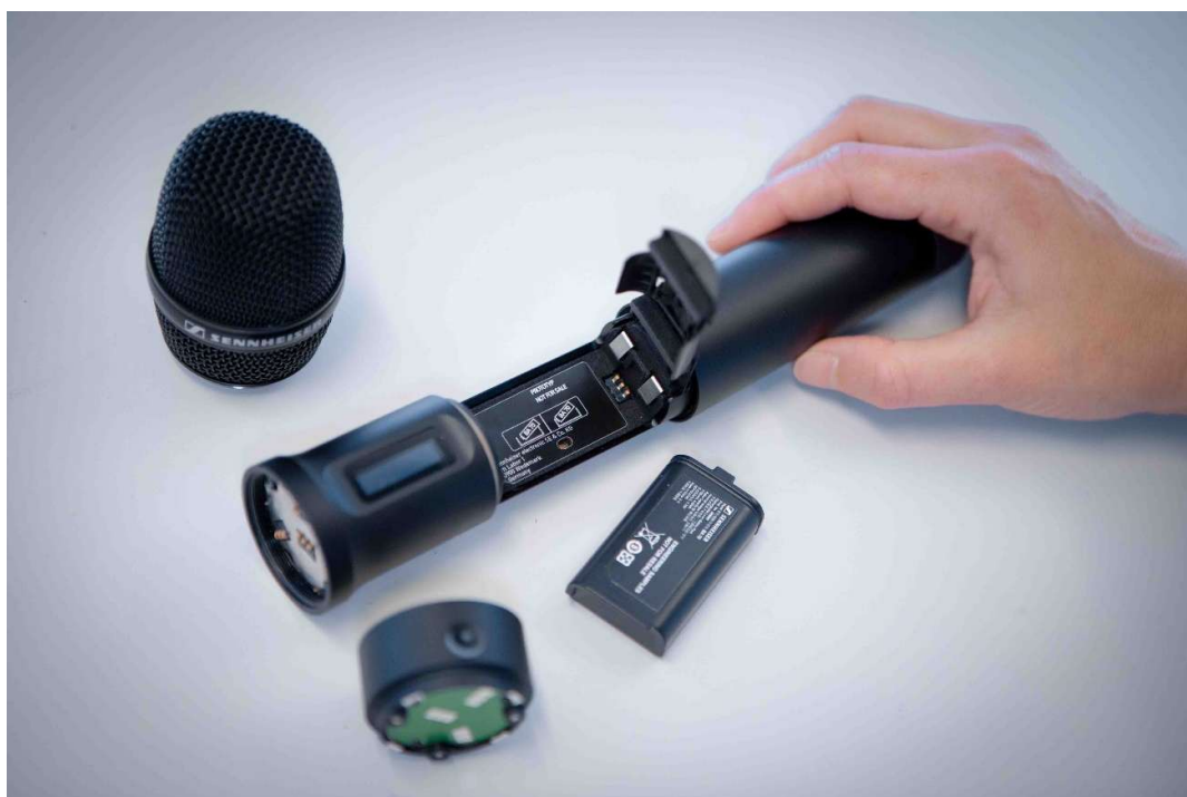
The modular Spectera handheld transmitter with the programmable Command adapter

Spectera, the world's first bidirectional wideband wireless ecosystem, continues to evolve, with the Spectera Lab previewing the most exciting upcoming functionalities. For example, ISE visitors can explore the SKM handheld transmitter including the Command adapter and the Base Station ZMAN for SMPTE 2110 broadcast workflows. Also, Sennheiser will in future give access to Spectera's API, allowing for advanced customization and control across multi-vendor workflows. Sennheiser's Spectera experts will be on site to give guests a deep dive into the Sennheiser implementation of WMAS and the many advantages it brings to wireless workflows.