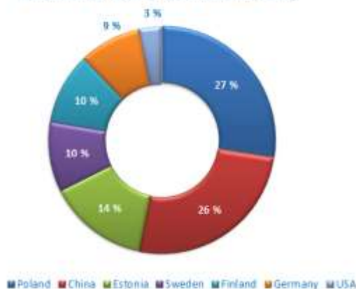
Personnel by Country 3,647 (30 June 2019)

At the end of the period under review, the Group (including HASEC-Elektronik GmbH's 200 persons) employed 3,647 (3,484) people, of whom 3,275 (3,105) worked outside Finland and 372 (379) in Finland. The average number of Group employees during the review period was 3,476 (3,446) people.